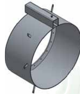
flange for installation in concrete tank

The text and technical data given may not be reproduced partly or completely without permission from Landia A/S. We reserve the right to make technical alterations. CL00B.C15-010209