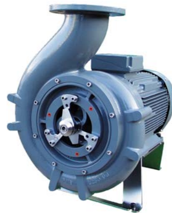
Landia motor pompe type MPTK

Many advantages can be achieved by applying a dry installed motor pump in a PE-pit in connection with vacuum evacuation pig slurry systems: